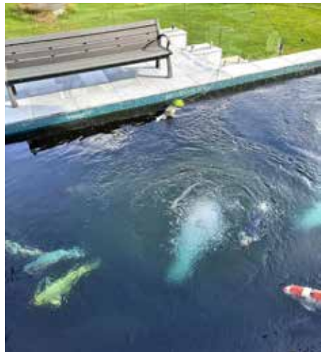
Gin clear water in Dave and Mandy's modern main koi pond.