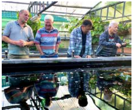
Conversations around koi.