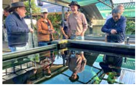
A chance to ask questions.