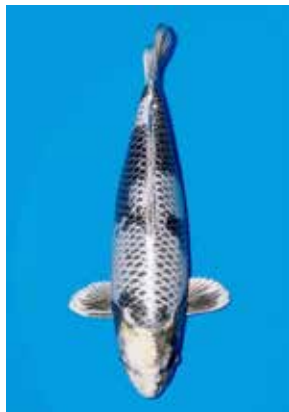
Gin Shiro Utsuri

Top-shelf superb examples of what the koi variety Hikari Utsurimono can look like.