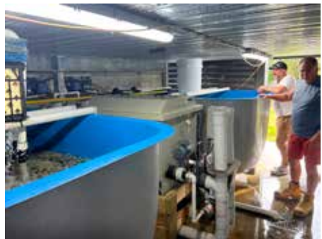
State of the art filtration system beneath Dave's impressive pond.