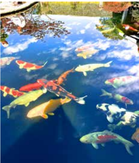
Koi enjoying the visitors and sunshine after such a long period of wet weather.