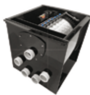
DracoDrum Solum 70 Capacity of 70,000 LpH