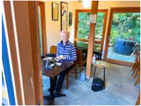
Photo 31: We very much enjoyed our tea. Such an interesting little venue.