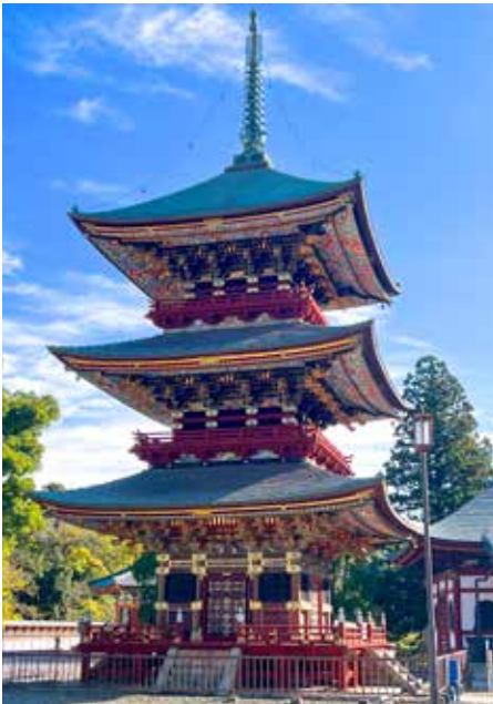
Photo 26: One of the magnificent buildings in the Naritasan Shinsho-ji Temple grounds.