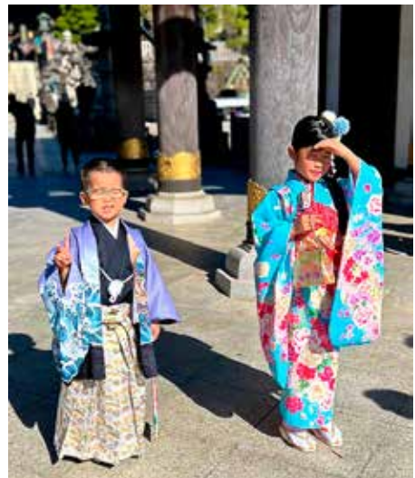
Photo 32: Two children in lovely traditional costumes seen at the temple.

One exceptionally interesting koi deservedly won quite an array of awards, including the Australian Koi Association (AKA) Friendship Award. Difficult to classify past Kawarimono (something strange) it looked to certainly have some Ochiba Shigure (grey koi with orange/brown patterns) in its background, but quite what else was a bit of a mystery. It was slightly