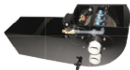
DracoDrum Minima Combi Capacity of 10,000 LpH

For more information www.aussiekoiwa.com or 0419 907 973