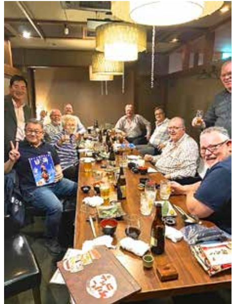
Photo 2: Catching up with a lot of very good international friends

We duly set off on Friday morning just after 5 am—definitely advisable to leave plenty of