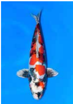
Doitsu Kin Showa