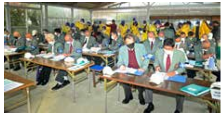
Photo 3: Early morning judges' meeting.