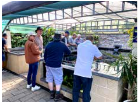
Lovely to see the AKA members on the pond tour.