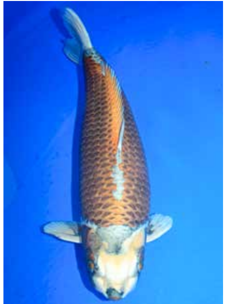
Photo 12: Best Kawarimono and AKA Friendship Award, a very unusual koi.