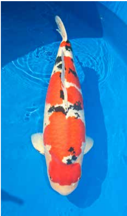
Photo 5: ZNA Grand Champion 94 cm Sanke bred by Sakai, owned by Kazuhiko Odawara.