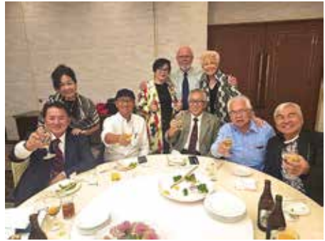
Photo 19: Enjoying the Saturday night official ZNA evening with our international friends.