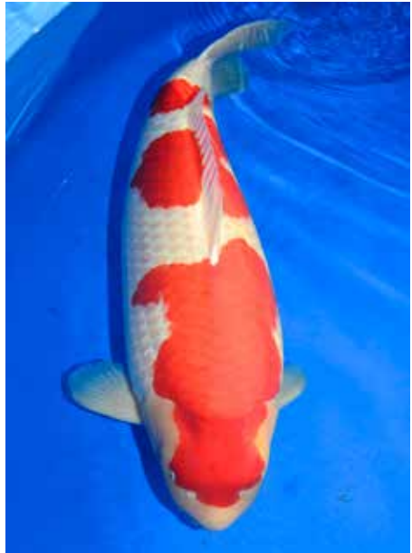
Photo 7: Superior Champion over 85 bu Kohaku. A good example of the superb quality of the koi at this show.

Each judging team now assembled with assistants wearing highly visible, bright fluorescent yellow jackets to lead the way to each bin housing a koi to examine. The assistants at these shows are Assistant Certified Judges gaining experience prior to being made up to fully Certified Judge. We had Rene Shoenmaker from South Africa and Ng Yit Kok from Malaysia on our team. Rene made us all laugh—he is such a big tall guy, unmissable in the yellow jacket—all we had to do to find the next bin was look for Rene (photo 6)!