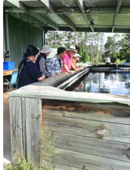
Raising ponds to determine which koi get kept and which get sold.