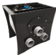
DracoDrum Solum 16 Capacity of 16,000 LpH