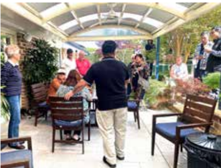
Conversations over morning tea.