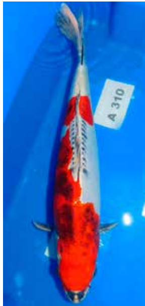
2nd - Des Howlett Size 3, Metallic (36 cm) Breeder: