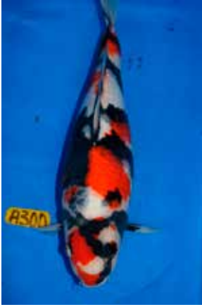
1st - Allan Bennett Size 4, Showa (48 cm) Breeder: Allan Bennett