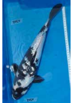
3rd - Jared Conti Size 4, Kinginrin (41 cm) Breeder: Jared Conti