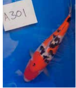
3rd - Janson Soo Size 3, Sanke (33 cm) Breeder: Allan Bennett