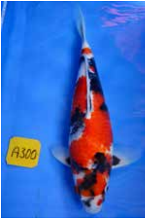
1st - Allan Bennett Size 3, Showa (38 cm) Breeder: