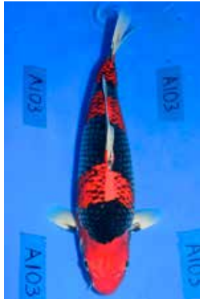
2nd - Heinz Zimmermann Size 4, Non metallic (49 cm) Breeder: