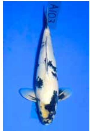
3rd - Heinz Zimmermann Size 4, Utsurimono (41 cm) Breeder: