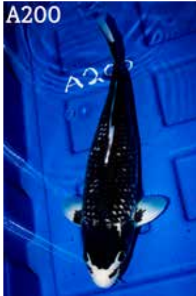
2nd - Bradley Bradley Size 3, Non metallic (39 cm) Breeder: Bradley Bradley