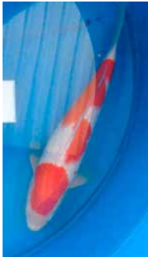
2nd - Dick Power Size 3, Kohaku (31 cm) Breeder: Dick Power