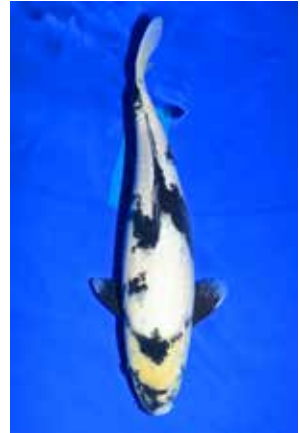
3rd - Joe & Rita Borg Size 3, Utsurimono (39 cm) Breeder: Joe Borg