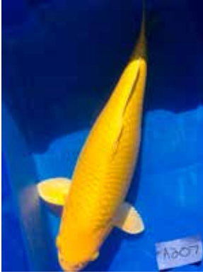
1st - Edison Jap Size 4, Metallic (50 cm) Breeder: Edison Jap