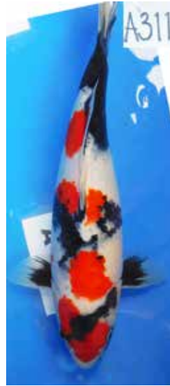
Variety Champion: Showa Brett Howlett Size 3, Showa (36 cm) Breeder: Phong Ta & B Howlett