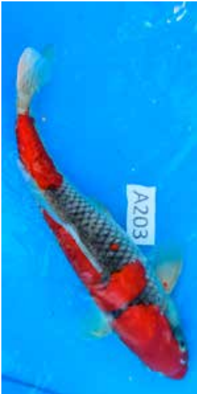
1st - Sam Grech Size 4, Non metallic (42 cm) Breeder: