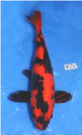
1st - Mick Steele Size 4, Utsurimono (42 cm) Breeder: