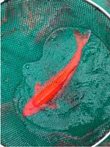
My Kuro Kado Goshiki when I first saw her.