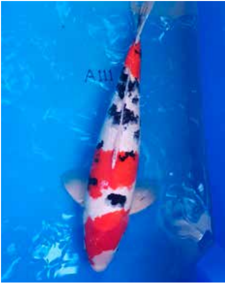
Variety Champion: Sanke TK Hing Size 4, Sanke (43 cm) Breeder: