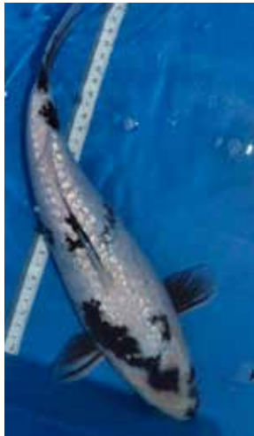
2nd - Jared Conti Size 3, Kinginrin (34 cm) Breeder: Jared Conti