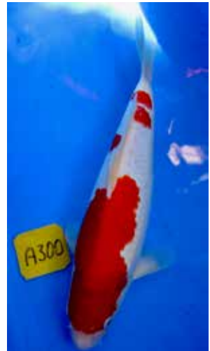
3rd - Allan Bennett Size 3, Kohaku (36 cm) Breeder: