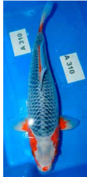
3rd - Des Howlett Size 3, Non metallic (35 cm) Breeder: