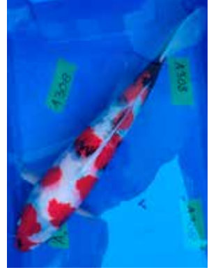
3rd - Alan Peck Size 4, Showa (46 cm) Breeder: