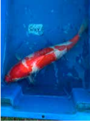
1st - Ping Chang Size 4, Kohaku (45 cm) Breeder: Allan Bennett