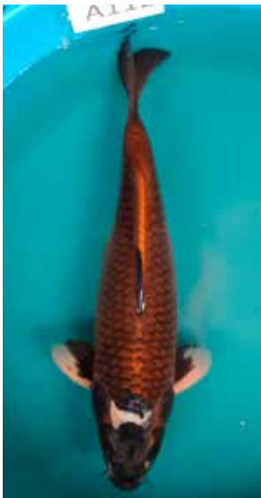
SAKKS Friendship Award 1st - Jimmy Tran Size 4, Non metallic (49.5 cm) Breeder: