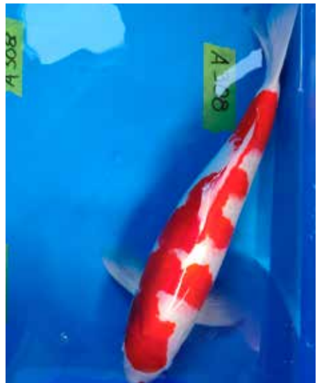
Variety Champion: Kohaku Alan Peck Size 4, Kohaku (46 cm) Breeder: