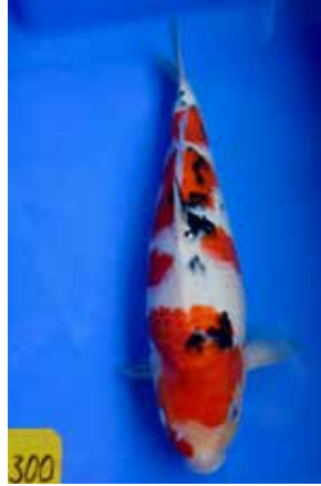
2nd - Allan Bennett Size 3, Sanke (37 cm) Breeder: