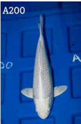
1st - Bradley Bradley Size 3, Metallic (36 cm) Breeder: Bradley Bradley