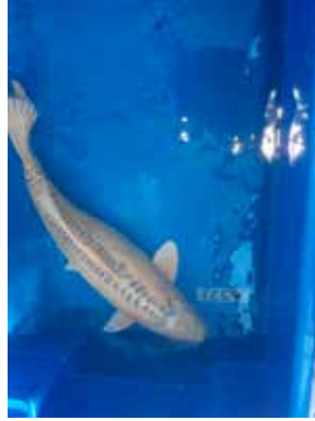
2nd - Ron De Waal Size 4, Metallic (49 cm) Breeder: De Waal