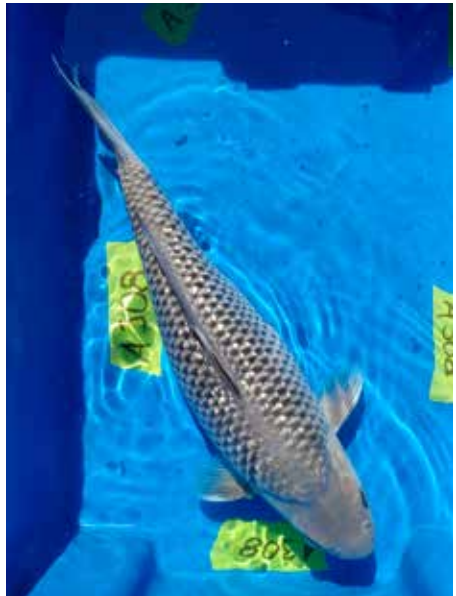
Variety Champion: Kinginrin Alan Peck Size 3, Kinginrin (35 cm) Breeder: