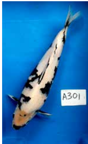
2nd - Janson Soo Size 4, Utsurimono (44 cm) Breeder: Allan Bennett