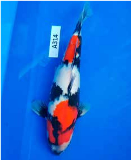
Grand Champion A 1st - Sai Thia Size 3, Showa (35 cm) Breeder: