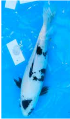
2nd - Sam Grech Size 3, Utsurimono (31 cm) Breeder: