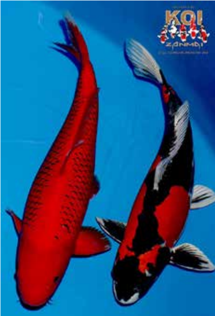
Here she is again twelve months later, alongside Aoki Koi Farm's superb kuro goshiki.