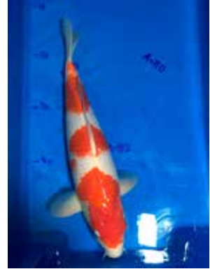
3rd - Peter Colgan Size 4, Kohaku (42 cm) Breeder: