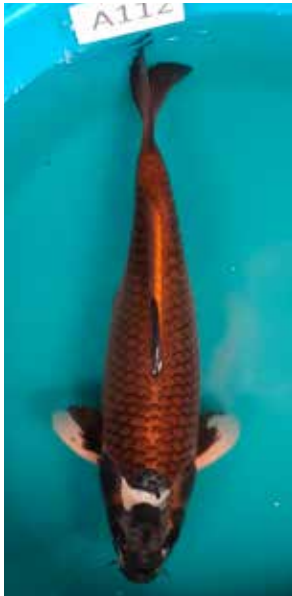
Variety Champion: Non metallic (all others) Jimmy Tran Size 4, Non metallic (49.5 cm) Breeder: