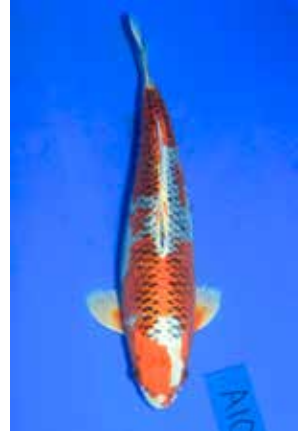
3rd - Heinz Zimmermann Size 4, Metallic (49 cm) Breeder: