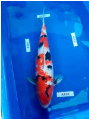
2nd - Sai Thia Size 4, Sanke (50 cm) Breeder: