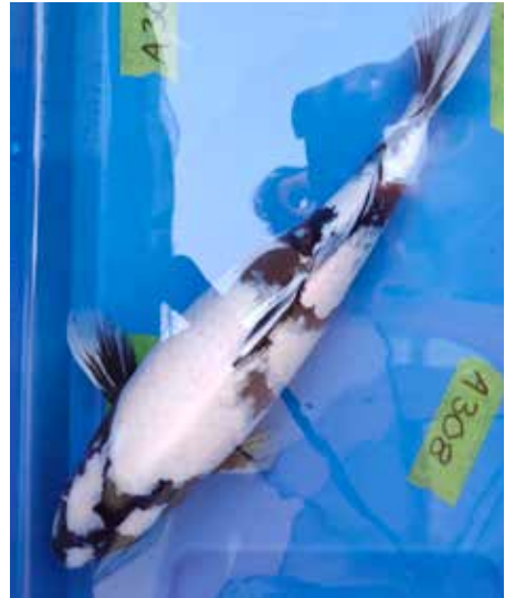
Grand Champion B 1st - Alan Peck Size 3, Utsurimono (35 cm) Breeder: